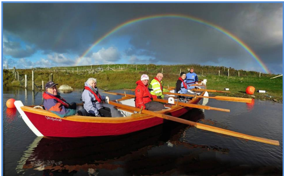
Yackydoola on Loch a' Bhaile with an able crew

Since then we have had a club trip to Shildaig Regatta where we competed in every event and impressed everyone with our fine new boat. Since August there have been many regular rowing sessions on Loch a' Bhaile, in Loch Carloway and even lunch time rows in Stornoway harbour. Thanks to Horshader the project is off to a flying start and ready to welcome anyone in the community that would like to have a shot at rowing. Drop us an email on aneathar@gmail.com you are going to love it