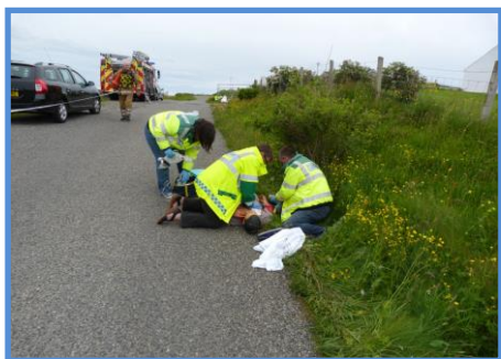
Carloway first responders Exercise with Shawbost Fire Service

Whilst improving our skills, the equipment in turn ensures we are able to provide a better service to the community.